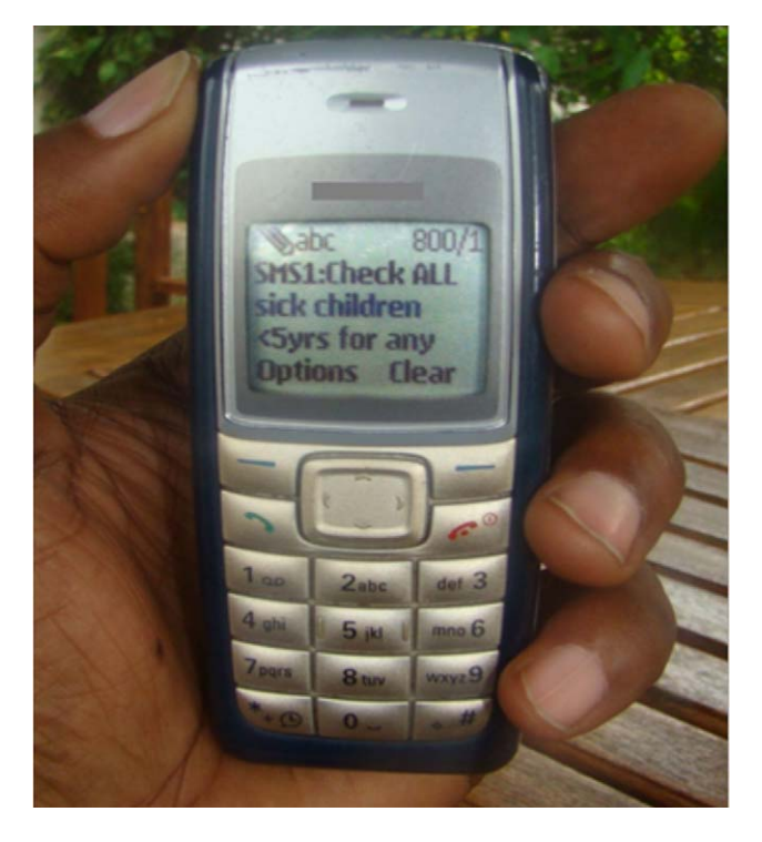
Figure 1. Example of mobile phones common in rural Africa. doi:10.1371/journal.pmed.1001176.g001

and treatment effectiveness surveillance, (2) monitoring the availability of commodities such as antimalarial medicines or